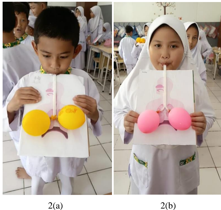
Figure. 2(a) and (b) Process of Implementing the Respiratory System Using the Teaching Aids Made