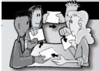
Figure 1. Simultaneous Roundtable steps

Note. Simultaneous Roundtable Steps. Adapted from "Kagan Cooperative Learning", by Kagan and Kagan, 2009, Kagan Publishing , p. 6.34. Copyright 2009 by Kagan Publishing.